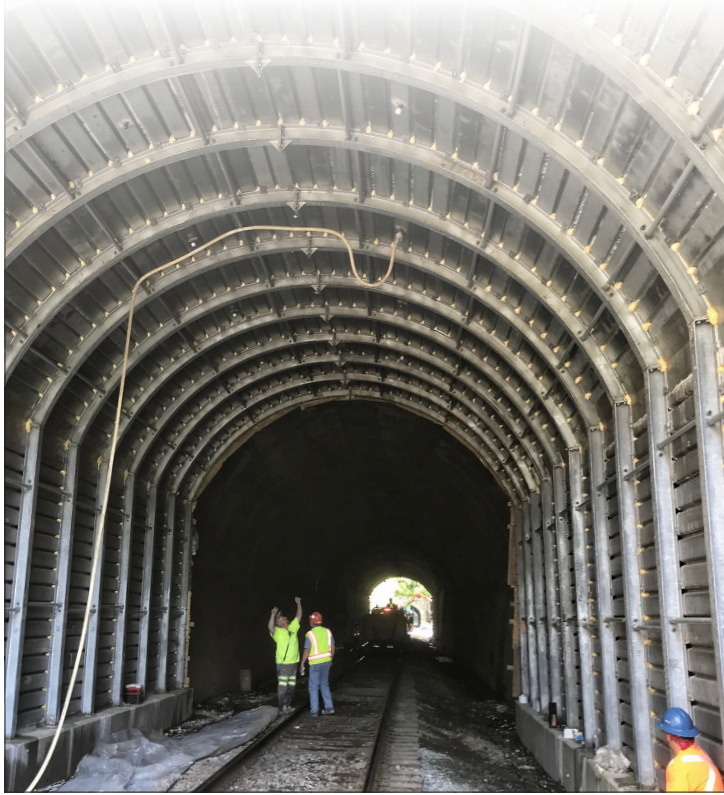
Installation of arch sets and backfilling in railroad tunnel.

GMS Geotechnical is a complete turnkey provider of geotechnical services with 12 regional offices throughout the United States and Canada.