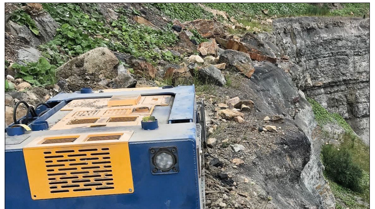
Bench cleaning and servicing with remotely-operated Badger.