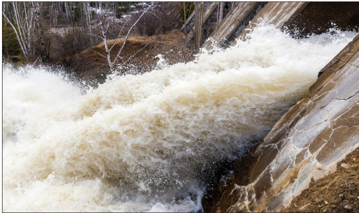
Dam failure. Repairs can be accomplished with chemical injection products, and microfine cementitious grout.