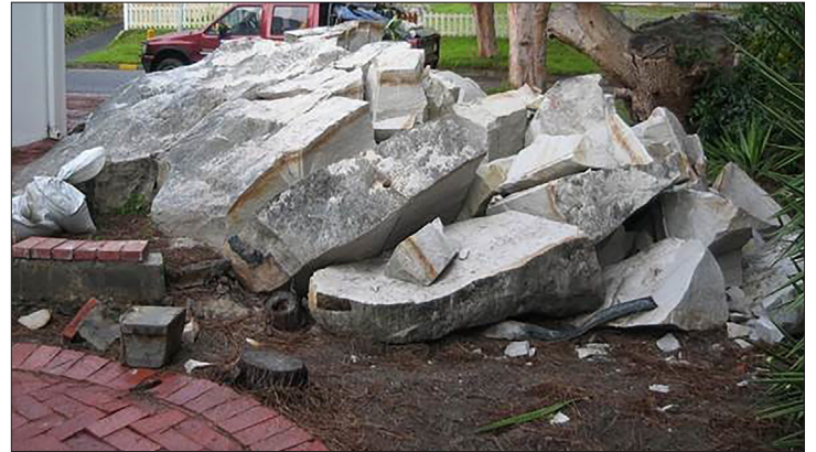
Sensitive, non-detonating, rock blasting in urban areas with nitrogen gas cartridges with minimal percussion or fly rock.