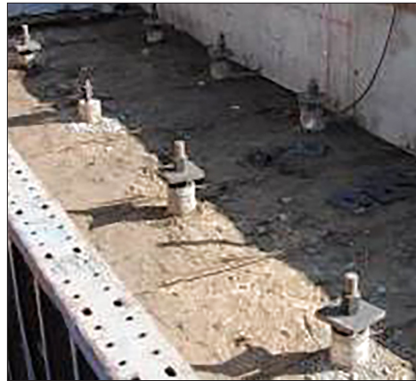
Completed micropiles installation.