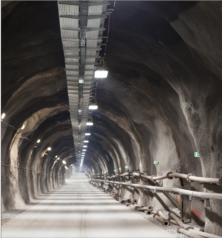
Arch set and shotcrete application.