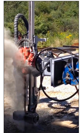
Drilling for micropile install.