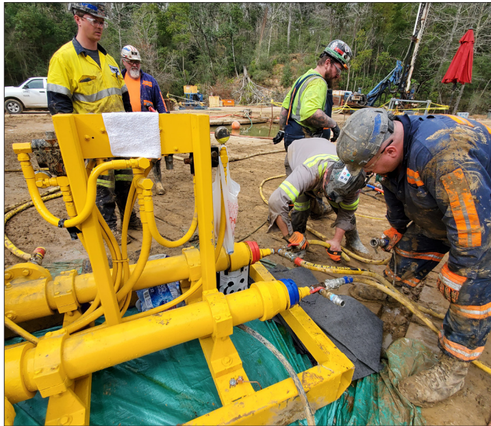
Down-hole surface grouting.